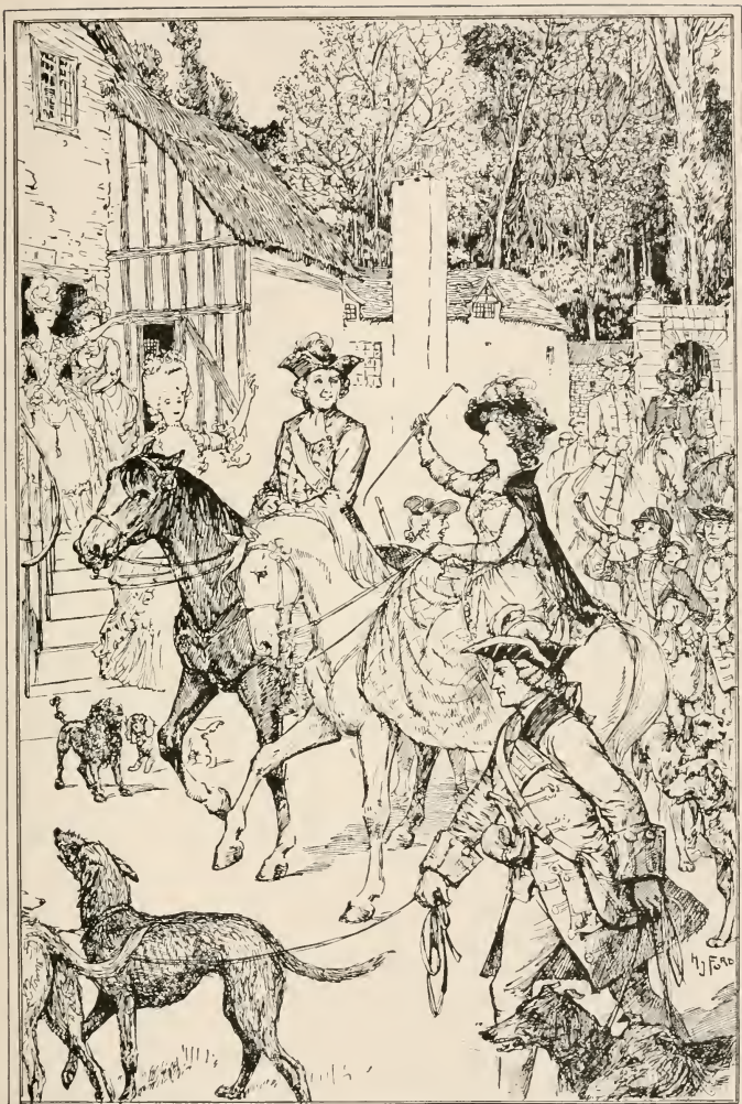
MARIE ANTOINETTE GOES HUNTING WITH THE DAUPHIN